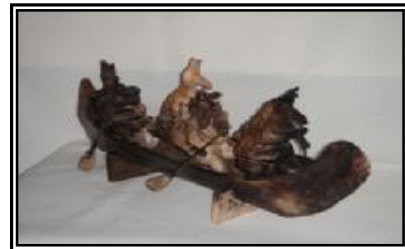
Best Non-Functional Philip Samuel Black